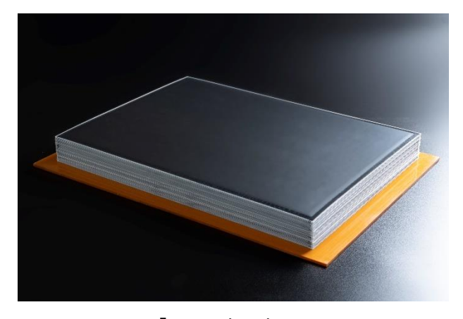
<u>Inner structure</u> Bipolarly connects 40 battery cells in series